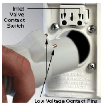
VACUFLO Inlet valves