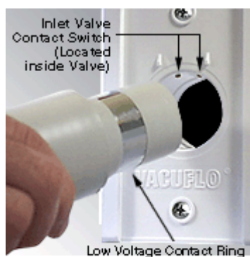
Universal Inlet valves

The Vacuflo Inlet Valve's low-voltage contact switches are above the valve opening. The low-voltage connection is made when the low-voltage pins on the hose are inserted into the contact switch.